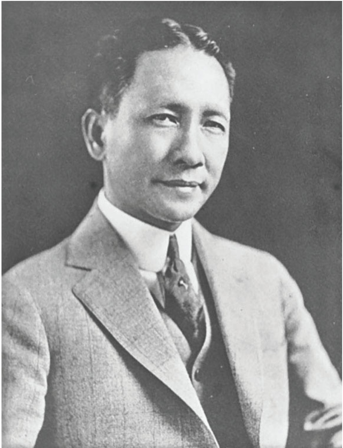
The Honorable Sergio Osmeña, First Speaker of the Philippine Assembly.